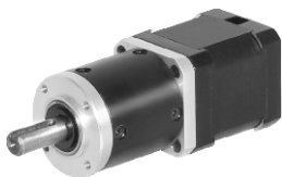
42JXT200K/42STH混合式步行星减速电机 减速器直径42mm，输出转矩20N.m Model: 42JXT200K/42STH (Stepping Planetary Gear Motor) Gearbox OD: 42mm; Output Torque:20N.m