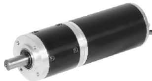
52JX300K/52ZY95直行星减速电机 减速器直径52mm，输出转矩30N.m Model: 52JX300K/52ZY95 (DC Planetary Gear Motor) Gearbox OD: 52mm; Output Torque:30N.m