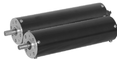
56JX300K/60ZY105BH直行星减速电机 带霍尔传感器，防护等级为IP65 Model: 56JX300K/60ZY105BH (DC Planetary Gear Motor) With Hall Sensor; IP65