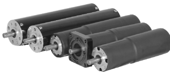
各种直行星“追日系统控制电机” Various Solar Tracker Motors