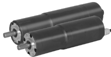
56JX300K/60ZY105B直行星减速电机 减速器直径56mm，输出转矩30N.m Model: 56JX300K/60ZY105B (DC Planetary Gear Motor) Gearbox OD: 56mm; Output Torque:30N.m