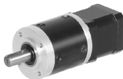
52JX300K/42STH混合式步行星减速电机 减速器直径52mm，输出转矩30N.m Model: 52JX300K/42STH (Stepping Planetary Gear Motor) Gearbox OD: 52mm; Output Torque:30N.m